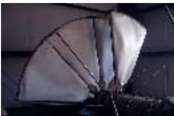
Filtration pumps will aid in collecting water that passes through its filter sectors.

Installation of the filter sectors on the Eimco filter was reported to be underway, and all the final adjustments necessary for it to operate were being made.