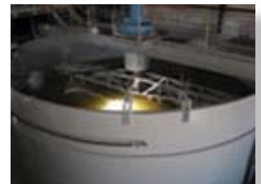
The water testing of the thickener allows the Deer Trail Mining Company to recycle a majority of the water used.