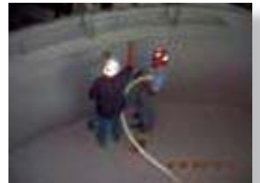
Main water lines will be used for the overflow of the thickener.

With the ongoing progress of work to complete the new electrical substation that will supply power to the Deer Trail Mine property, numerous electrical connections were also being made at the facility as the reconstruction work continued.