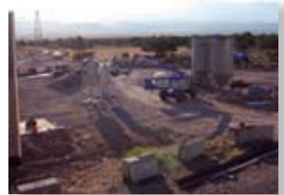
Filtrate Tanks will collect water that passes through the Filter Sectors.

The main water lines that will be used for the overflow of the thickener were installed, which will allow the Deer Trail Mining Company to recycle the majority of the water used in the floatation process, and the recycled water will be distributed throughout the mill for make-up water in the process.