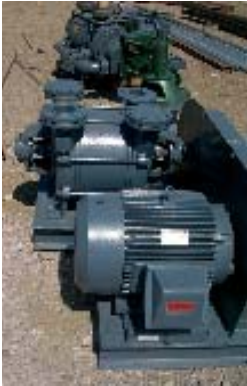
Vacuum pumps used for the Eimco filter

Throughout the month of August 2007, Unico, Incorporated updated its shareholders on the progress of additional reconstruction work at the mill and processing facility at the Deer Trail Mine in Marysville, Utah.